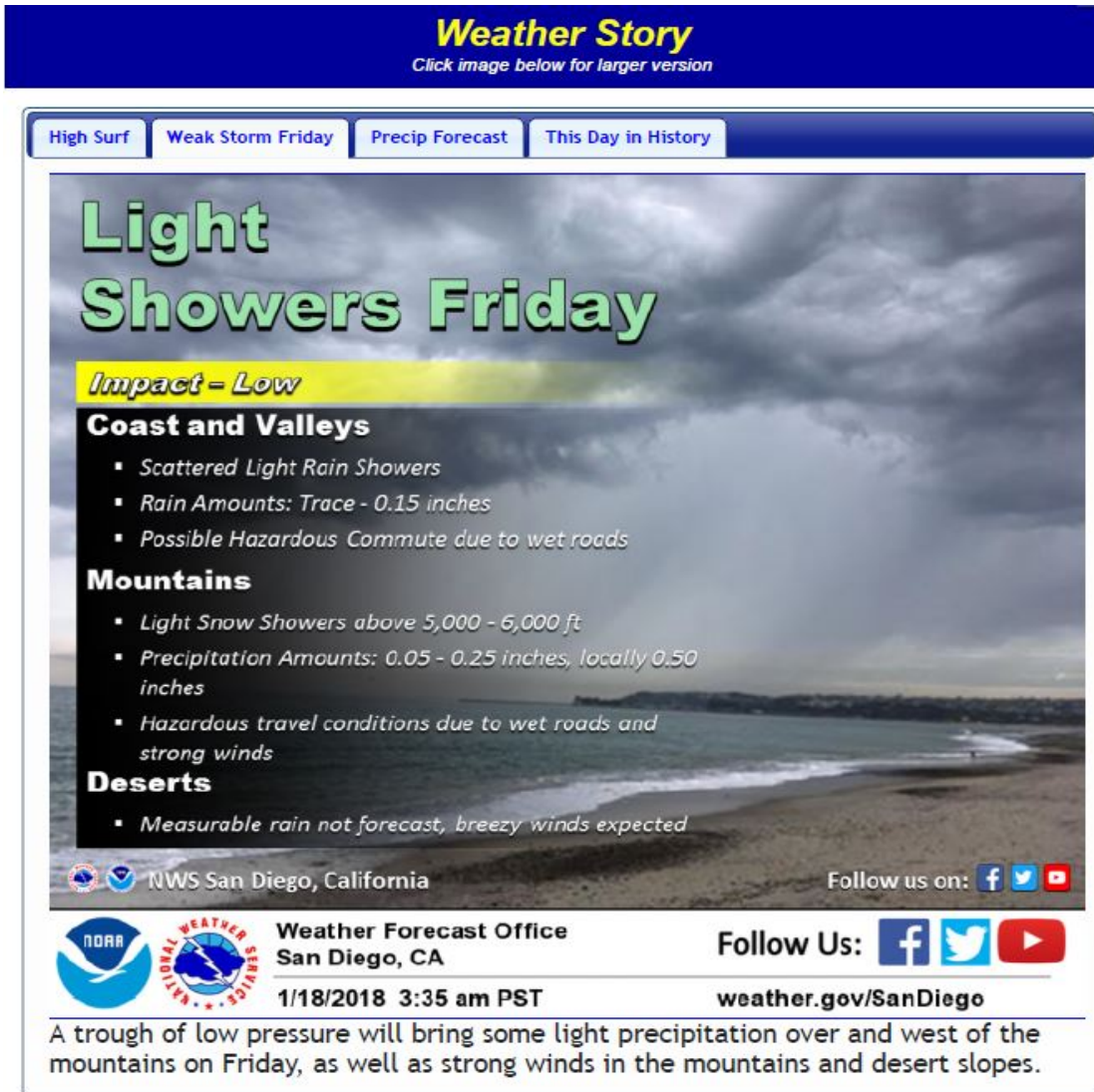
Fig C-4: Illustrates the strong winds forecast on the desert mountain slopes