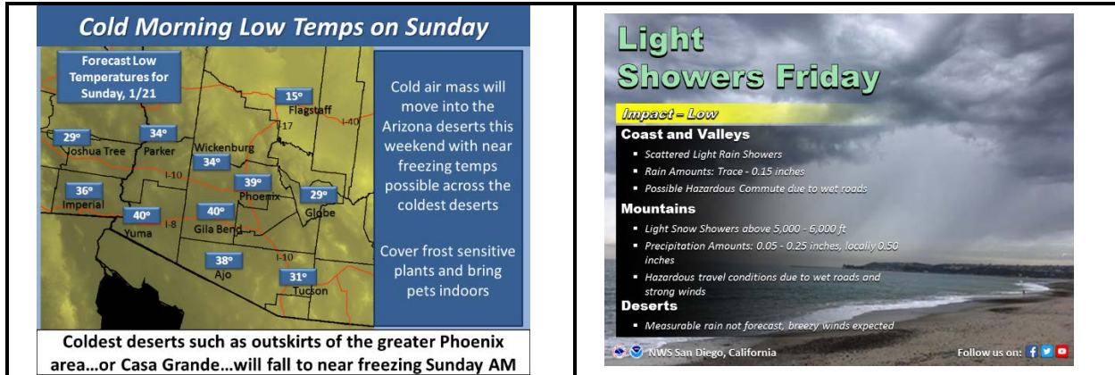
Fig C-2: Illustrates the public zones serviced by the National Weather Service Office in Phoenix and San Diego. Imperial County, including southeast sections of Riverside County are part of the reporting public zone areas from the Phoenix office